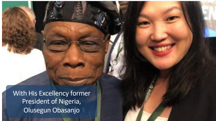
With His Excellency former President of Nigeria, Olusegun Obasanjo