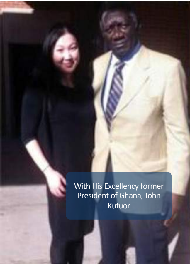
With His Excellency former President of Ghana, John Kufuor

Working with World Leaders on youth empowerment & startup innovation to help solve critical global challenges