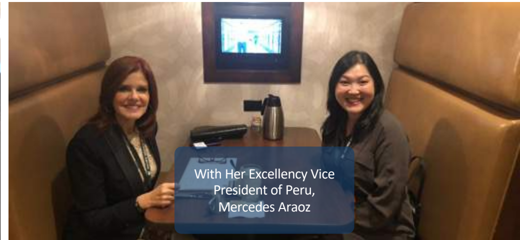
With Her Excellency Vice President of Peru, Mercedes Araoz